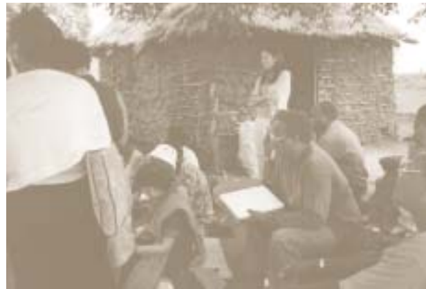
Talking with members of the community

In another session, participants were asked to work in groups and act out scenes about different people in different types of relationships, for example, a doctor diagnosing an HIV-positive status, work colleagues, spouses, in-laws, bosses and community members. After the groups acted out the scenes, the entire Workshop scrutinized them one by one thereby bringing out the complex net of human relationships that