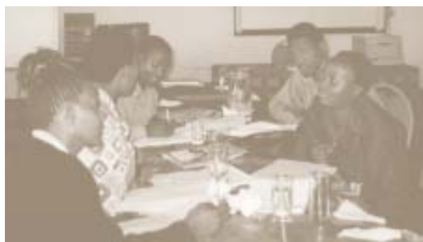
Men and women taking an active part in discussing social and cultural issues such as bride price, wife inheritance and status of women within the family

Along similar lines, euphemisms for AIDS also exacerbate the denial problem. "It is called 'slim' in Kenya as people living with it lose a lot of weight", said Therese Lesikel of WHO. But talking around HIV/AIDS does nothing to alleviate the situation. The workshop provided an ideal setting for bringing these subjects out of the shadows. The message, as UNAIDS' Bernadette Olowo-Freers puts it, "is to face one's HIV status and learn to live with it positively. Infected people can live for 10 years or even more." Her colleague, Tcebile, who was among workshop participants, is living proof of