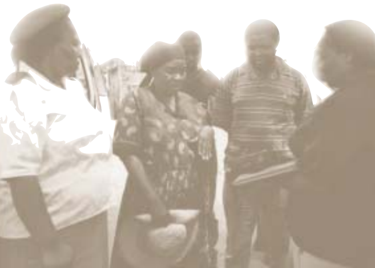
Discussing the needs and the problems of HIV/AIDS with the community and a health worker

M oreover, as stated above, in terms of “negotiating safe sex”, women generally feel that it’s a waste of time to even try. In these countries, women legally become minors under their husband’s care upon marriage. This is even more poignant where men pay lobola or bride price. Lobola lowers a woman’s status to that of her husband’s possession. Negotiation about anything is extremely difficult, much less a highly taboo subject like sex.