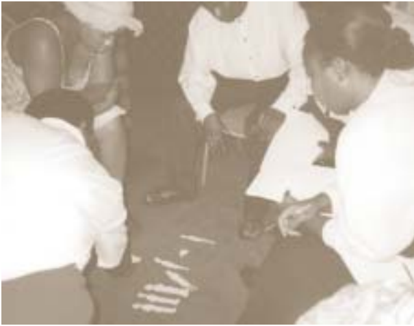
Practical exercises on the social impact of HIV/AIDS

In yet another session, participants again organized themselves into groups and were given a few cut out paper figures of human beings. They were then asked to place each one within a family relationship. Each group