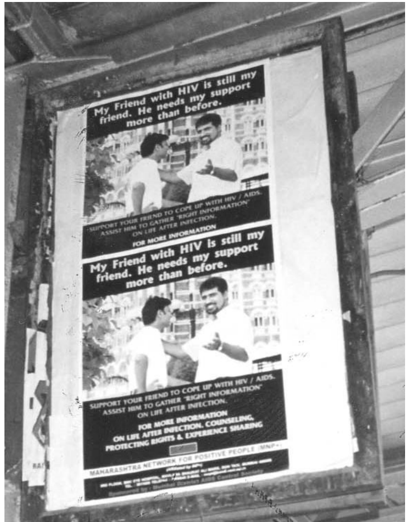
“My friend with HIV is still my friend” (poster developed by MNP+ and displayed at a train station in India).

meetings, taking into account gender and sexual orientation.