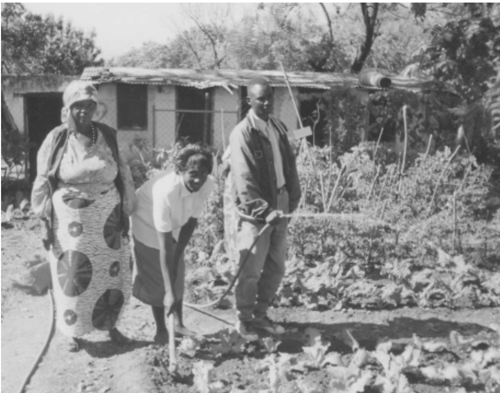
The Positive Living Advocacy Course of Hope Humana: PLHA learn gardening with an HIV-positive teacher.

NGOs can overcome many of the factors that limit involvement by implementing the following recommendations: