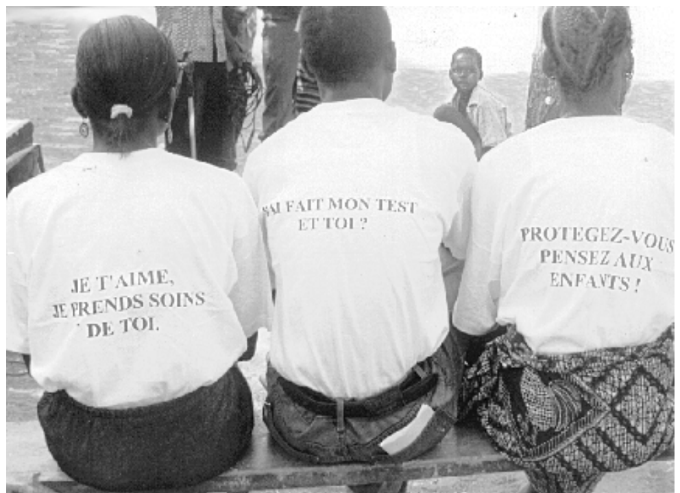
Members of REVS+ in Burkina Faso wear prevention messages during an HIV/AIDS awareness-raising campaign. From left to right: "I love you--I protect you," "I've been tested; have you?" and "Protect yourself--think of the children."

Nonetheless, respondents in all four countries reported drawbacks to PLHA involvement, depending on the activities carried out and the level of visibility. For example, when delivering care and support services, the psychological health of asymptomatic PLHA can be impaired as a result of contact with those who are very sick. In