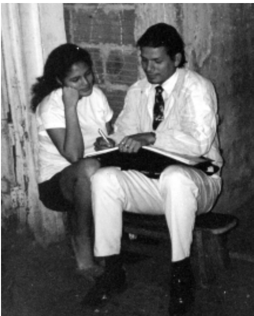
A member of Siempre Vida Foundation providing peer support, Guayaquil, Ecuador.

PLHA come to terms with their HIV status and provide information and skills to gain control over their lives.