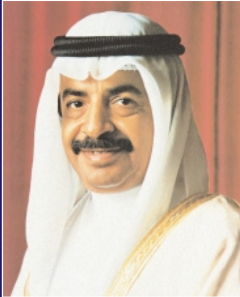
H.H. Shaikh Khalifa bin Salman Al Khalifa The Prime Minister