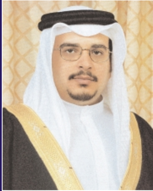
H.H. Shaikh Salman bin Hamad Al Khalifa The Crown Prince and Commander-in-Chief of the Bahrain Defence Force