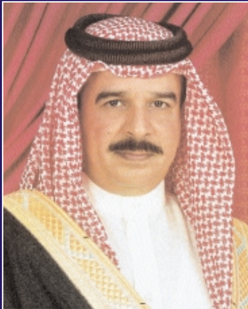
His Majesty King Hamad bin Isa Al Khalifa King of the Kingdom of Bahrain