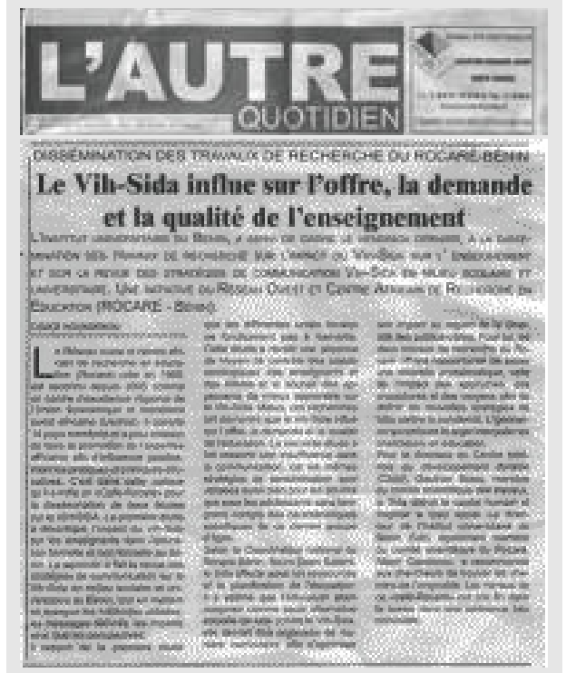
Figure 2: Clipping from daily newspaper in Benin

Sharing research findings is an important part of the research process at ERNWACA. ERNWACA Cafés were organized in each country involved in the study either to share and validate findings before the national reports were finalized or to share and discuss findings reported at national and regional level. These events are covered by the national press. See in Figure 2, for example, a clipping from a daily newspaper in Benin.